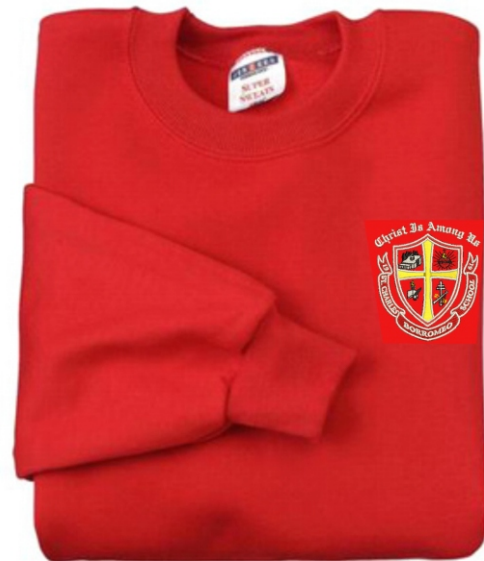
Red Uniform Sweatshirt with Embroidered School Crest