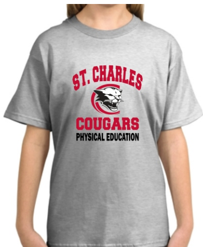
P.E. T-Shirt in Ash