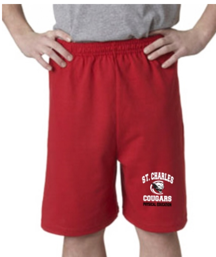
P.E. Jersey Shorts in Red