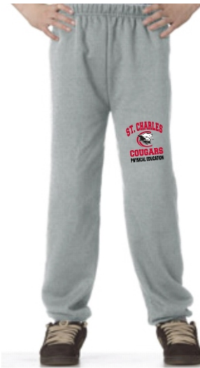
P.E. Sweatpants in Oxford